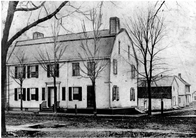
Augustus Filley House